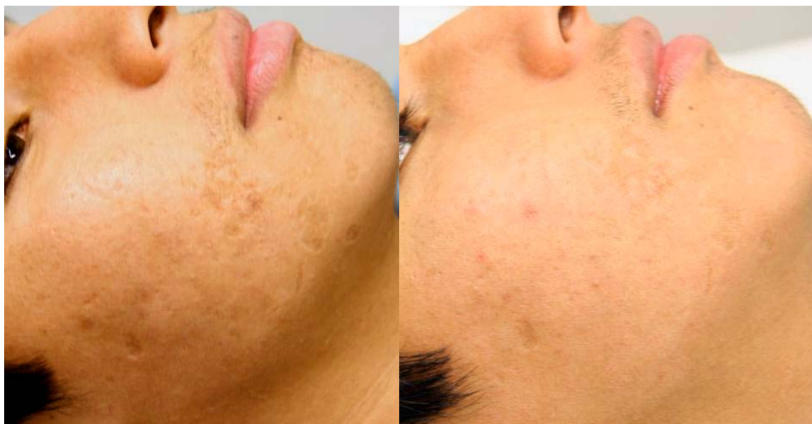
Picture 3: a 19 yr old Hispanic patient with hyperpigmented severe acne scarring. Left picture before treatment. Right picture 3 months after treatment (2 sessions with a 1-month interval). The improvements in skin colour and scar remodelling are visible.