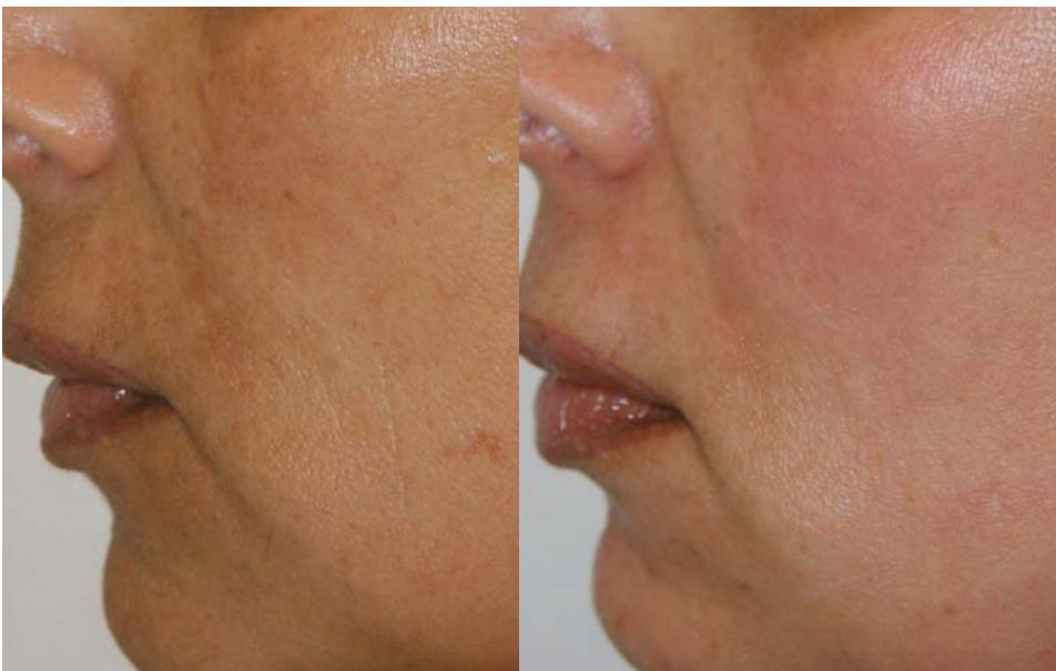
Picture 2: A 41 yr old patient with a Mediterranean skin and moderate sun damage. Left picture before treatment. Right picture 3 months after treatment. Notice the improvement in skin texture and colour. The fine wrinkles are almost erased from the cheek.

Some examples of the results are visible pictures number 2 and 3.